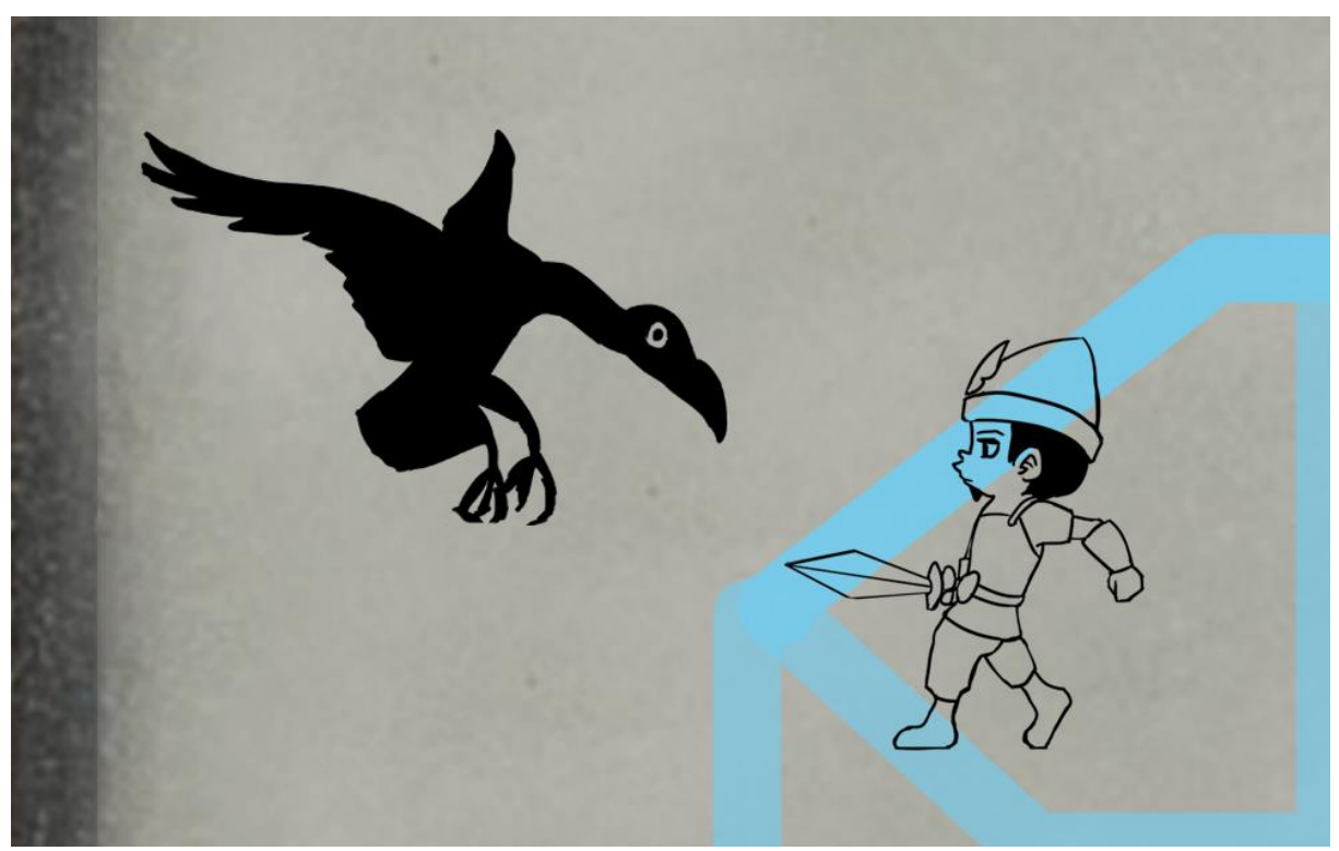
The player is about to get hit by the bird.

Another way for the player to get a " Miss " is whenever a hostile bird reaches the Sultan and attacks him.