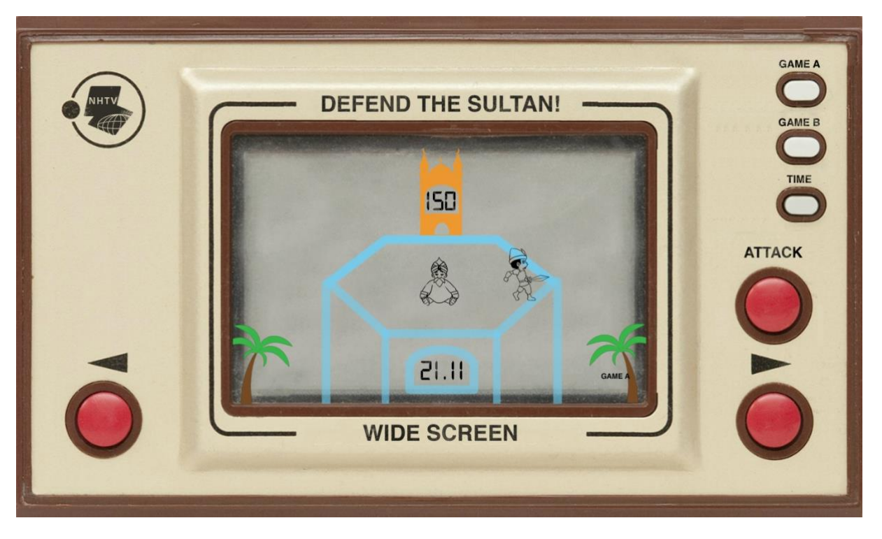
The starting screen showing the position of the player, Sultan, game type and time.

The player controls the Royal Guard whose task it is to fight off the birds intending to kill the Sultan. In GAME A all birds are hostile, while in GAME B there are birds who will bring the Sultan gifts. If the console is turned on the player will see an animation of the Royal Guard walking around. If the player chooses a game type (A or B) the player will start at the starting location as shown in the picture below.