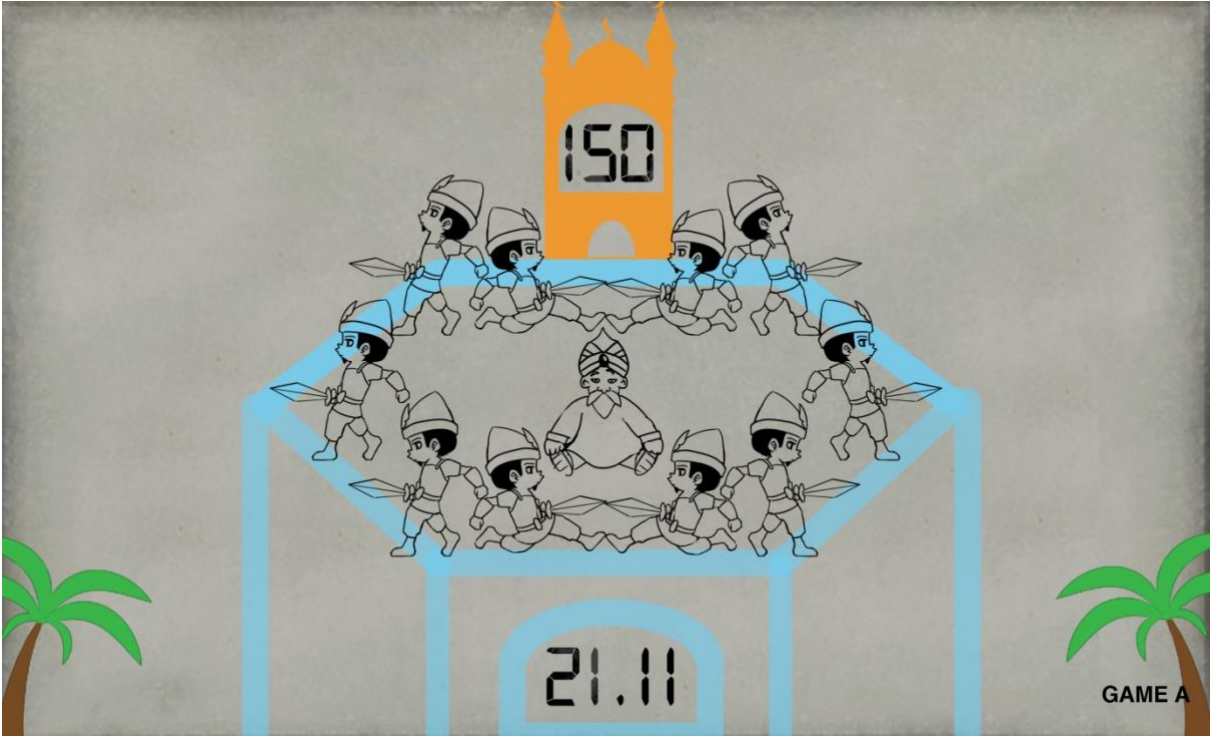
All positions of the character

The player controls the Royal Guard using the left and right buttons. If you are at the far right or far left and use your left button you will turn left. If you use the right button you will turn right.