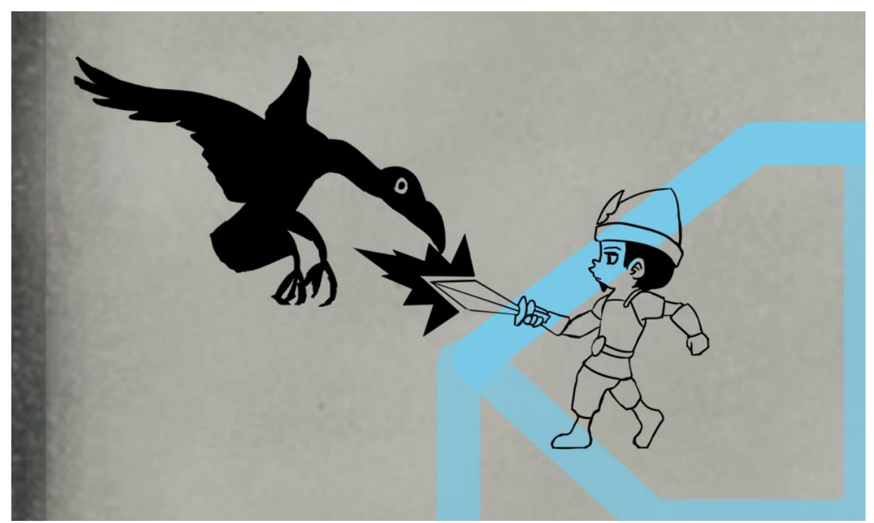
The player attacks a hostile bird