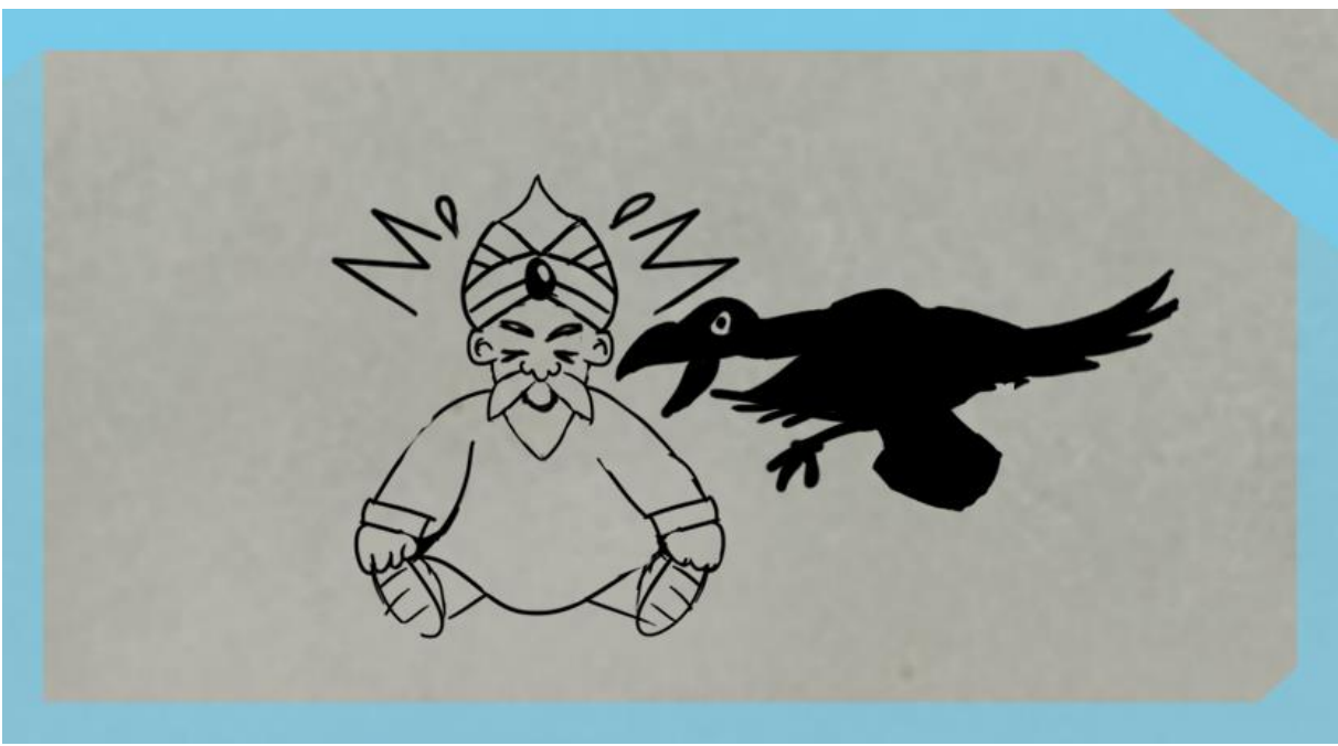
The Sultan gets attacked by the bird.