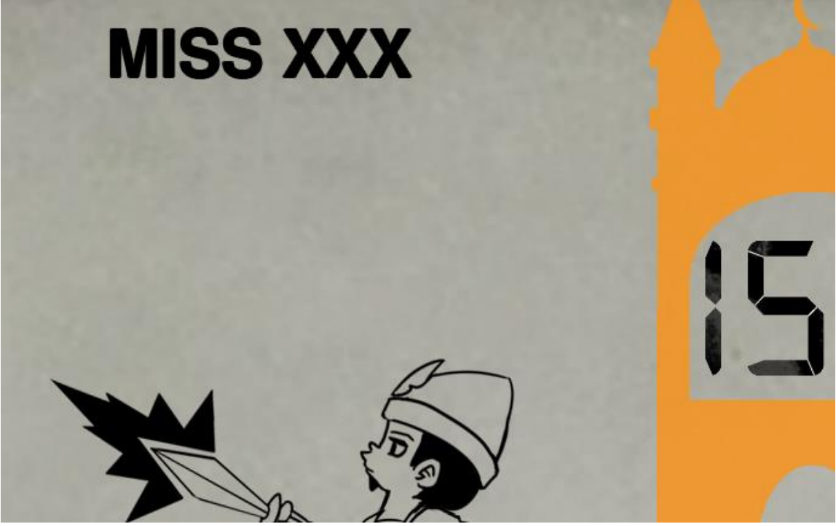
The player has 3 X's, which means that the game will stop