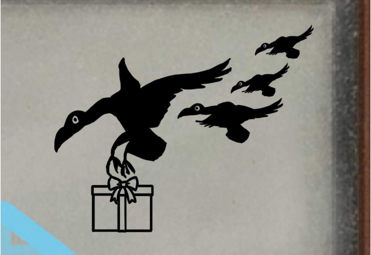
A Friendly bird carrying a gift for the Sultan.